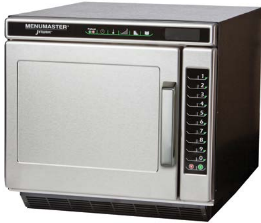
Model JET19V shown