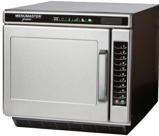
Model JET14V shown