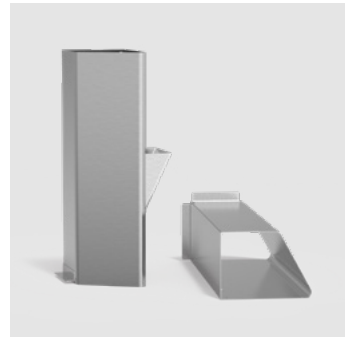
Adaptable chutes for counters