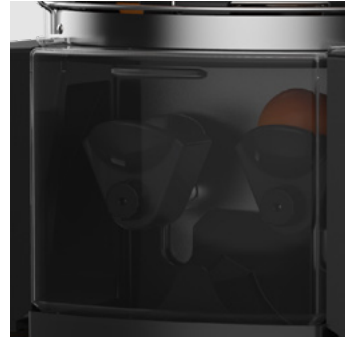
Smoky grey front cover

The Auto Cleaning System improves the juicer's efficiency due to the automatic cleaning filter. The new filter has a belt made of polyurethane that moves, thanks to a motor axle, when the squeezer is running. The belt cleans the filter by sweeping the pulp and the seeds resulting from juicing the fruits, which are then collected in the peel collection bins.