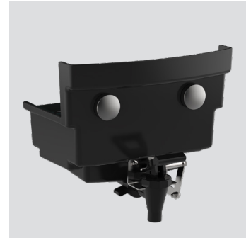
Injected Self Service Tray