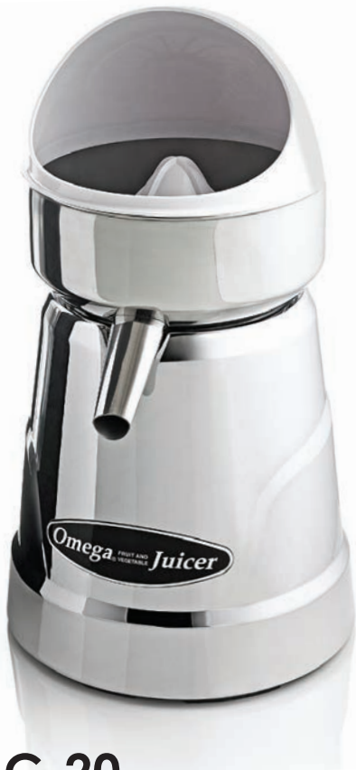
Model C-20 Citrus Juicer