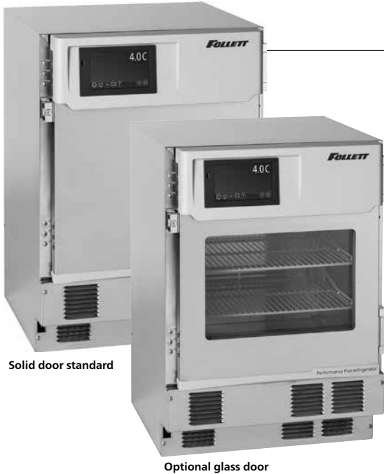
Solid door standard