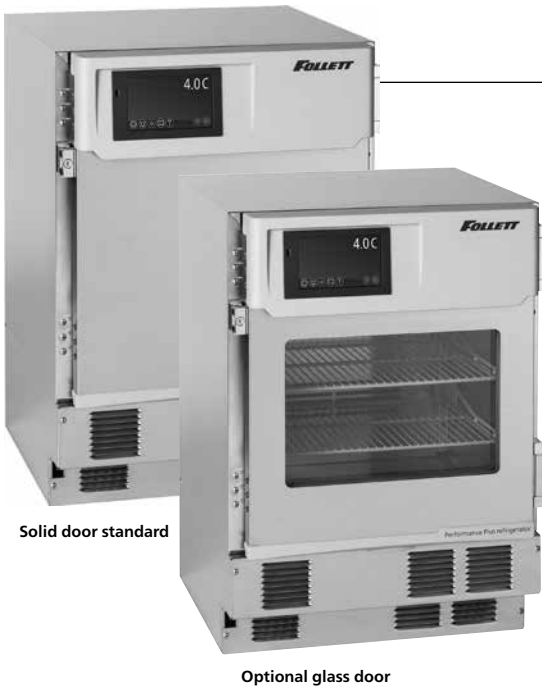
Solid door standard