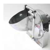
Food slicer 312GS