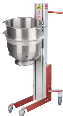
Bowl lift Easylift II