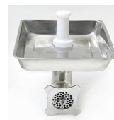
Meat grinder 302