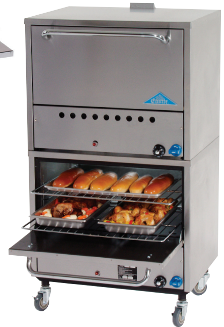
2B31N (shown with optional casters)