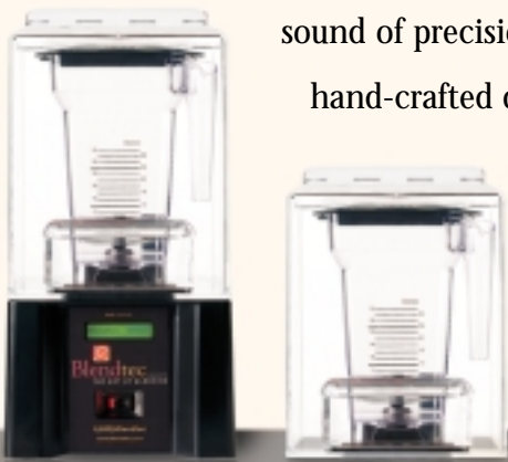
Above-Counter Smoother TM

"Shhhh." Our blenders are often found in bookstore cafes. What you hear is the quiet sound of precision and hand-crafted quality.