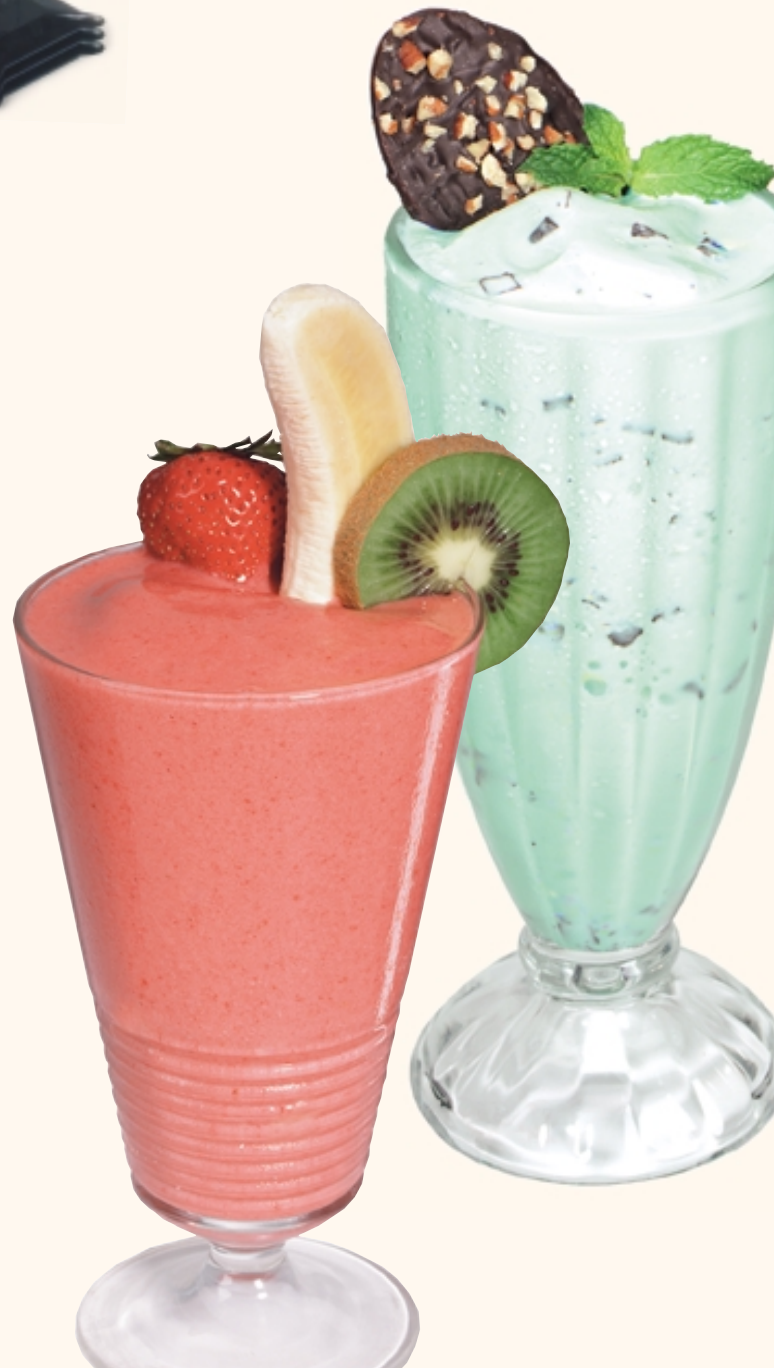
In-Counter Smoother TM