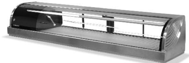
HNC-180BA-L(R)-S W x D x H 70.9" x 13.6" x 11"