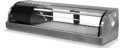
HNC-120BA-L(R)-S W x D x H 47.2" x 13.6" x 11"

*Refrigerated Display Case - Not for overnight storage