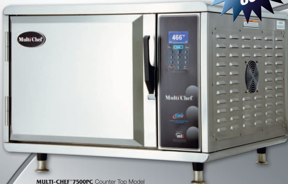
MULTI-CHEF™ 7500PC Counter Top Model