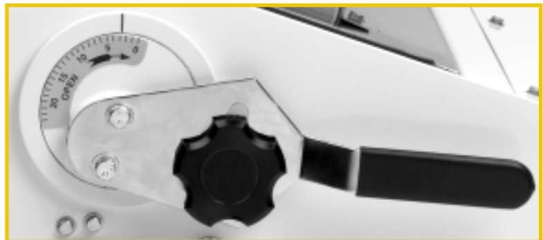
Simplified infinite roller adjustment.