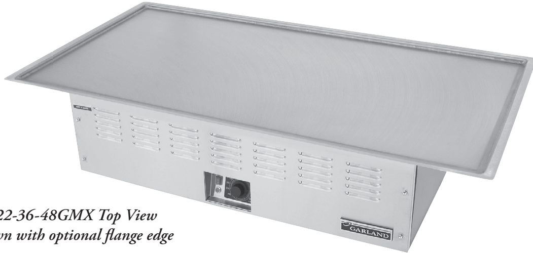
E22-36-48GMX Top View Shown with optional flange edge