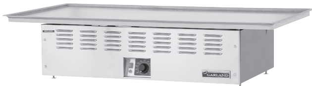
E22-36-48GMX Front View Shown with optional flange edge