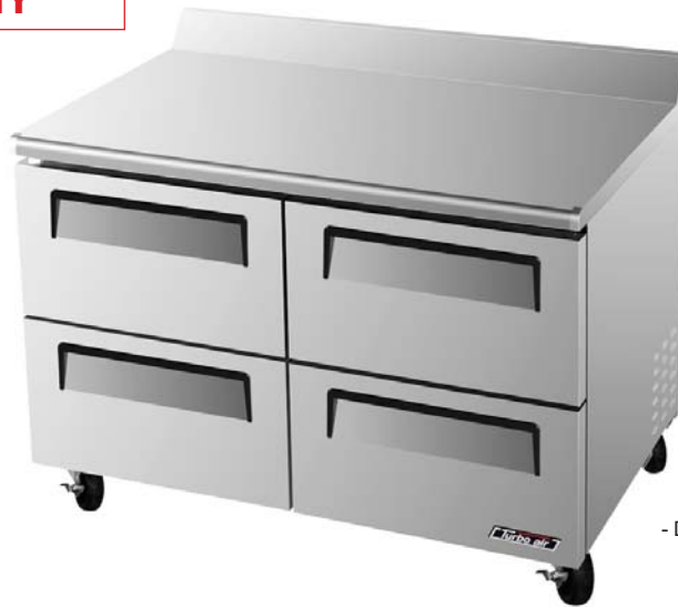
- Drawer pans not included