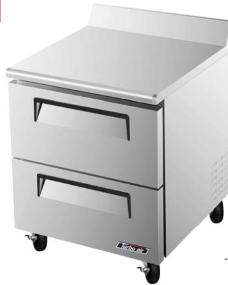
- Drawer pans not included