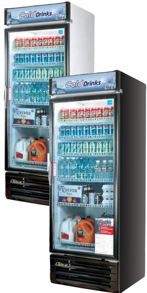
*Actual shelf organizer may differ in appearance with above picture.