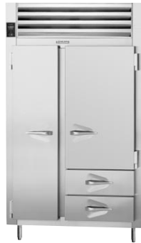
Dual-Temp Model UR48DT (shown as supplied standard)