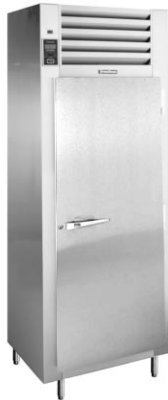
Freezer Model UR30LT