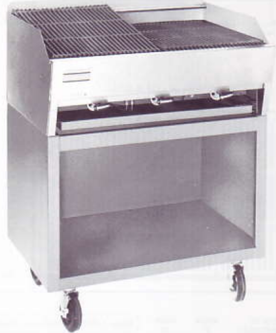
Model 3223-F-C Pictured With Optional Casters.

Self cleaning, long lasting, natural volcanic char rock radiants are used to give the authentic effect and true flavor of Char Broiling. The lava rock provides the same flavorful results as charcoal, but without the high cost or replacement hassle. Rapid heat up to broiler temperatures in less than ten minutes. Excellent for exhibition cooking.