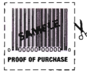
Sample UPC code. UPC code is located on the side panel of product packaging.

For offer inquiries call: 1-800-324-5808