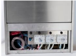
3 Peristaltic Pumps

Slide out control panel providing quick access to all essential electrical components