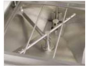
Inner Wash Tank

Maintains wash water at the proper temperature