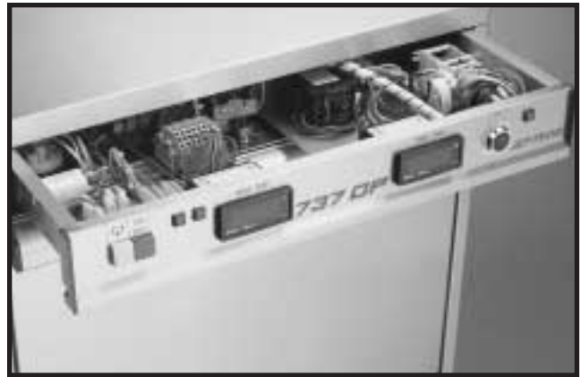
Removable integrated control panel

In line with our continuing policy on research and product development, we reserve the right to alter specifications without notice.