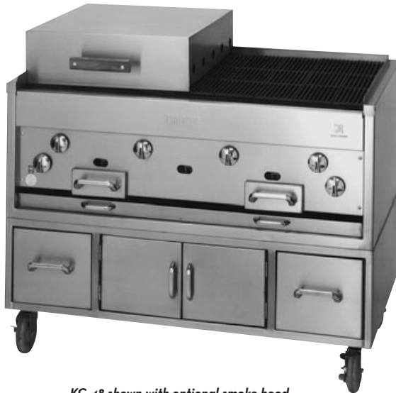
KC-48 shown with optional smoke hood, stainless steel enclosed stand and casters