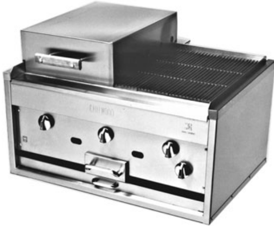
KC-36 shown with optional smoke hood