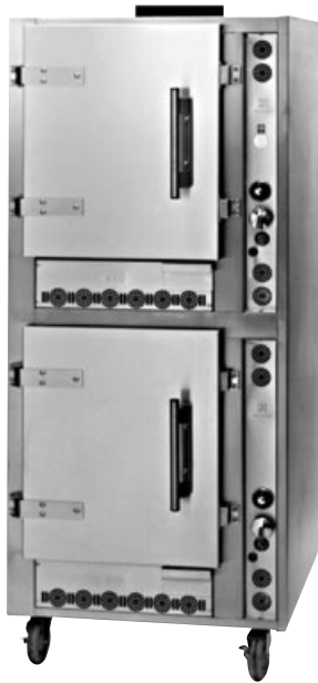
MDL-250 shown with optional stainless steel sides and casters