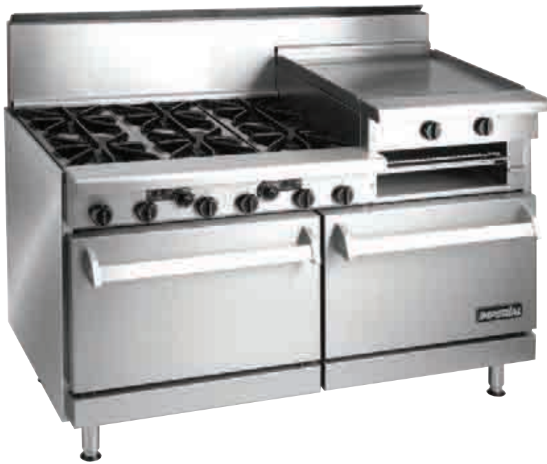
Model IDR6-RG24 Imperial Residential Range 61" (1549) wide, with 6 open burners, 24"(610) griddle/broiler and two 26½" (673) ovens