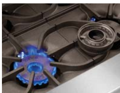
Two rings of flame for even cooking no matter the pan size.