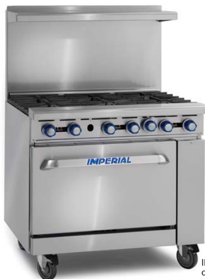
IR-6 shown with optional casters

OPEN BURNERS - PyroCentric™ 32,000 BTU (9 KW) anti-clogging burner with a 7,000 BTU/hr. (2 KW) low simmer feature. Cast iron PyroCentric burners are standard on all IR Series Ranges.