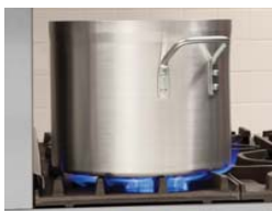
Back grate hot air dam deflects heat onto the stock pot, not the backsplash.