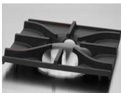
Top grates with anti-clogging pilot shield protect the pilot from grease and debris.