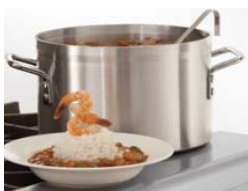
Large 5" (127 mm) stainless steel landing ledge for convenient plating.