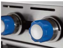
Durable cast aluminum with a vylox heat protection grip.