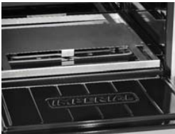
Splatter screen protects the element from spills.