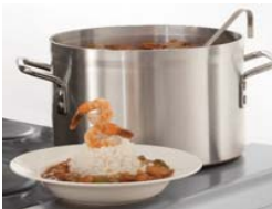
Large 5" (127 mm) stainless steel landing ledge for convenient plating.