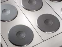
9" (229 mm) sealed round plate elements with easy to clean flat surface.