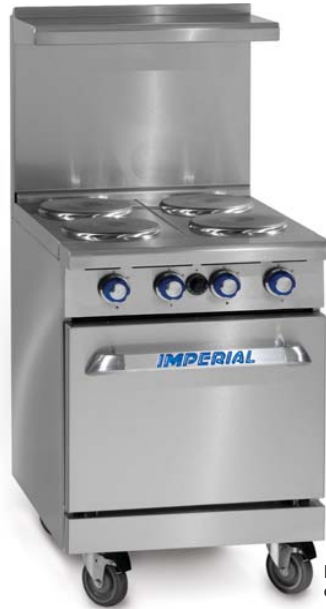
IR-4-E shown with optional casters