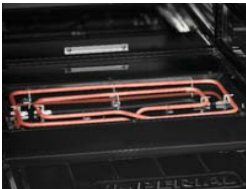
5 KW element provides even heating throughout the oven cavity.