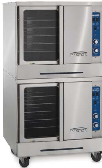
ICV-2 shown with optional casters

Four bearings per door extend the life of the door mechanism.