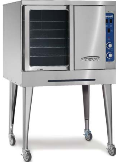
ICV-1 shown with optional casters

Four bearings per door extend the life of the door mechanism.