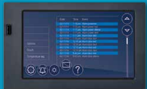
Event and data logging with easy downloading via convenient USB port