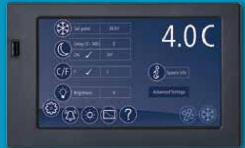
Quick access to control settings

Optional 7" full-color capacitive LCD touchscreen provides direct access and control to key settings