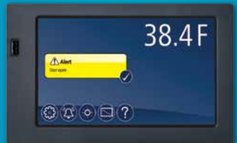
On-screen alarm and event notification. Additional capabilities with battery back-up, including power loss and door open alerts.