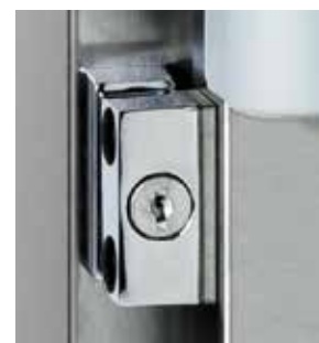
Universal ADC door bracket