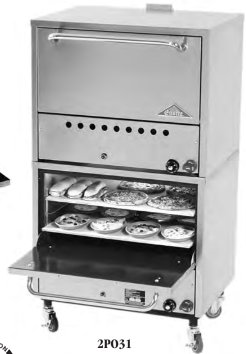
2PO31 (shown with optional casters)